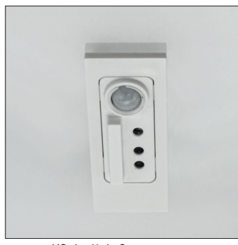
XC daylight&occ sensor

All current index numbers, lumen outputs, power consumption and many other technical information are available in our 2024 pricelist. Details on wireless lighting control systems on page number 896.